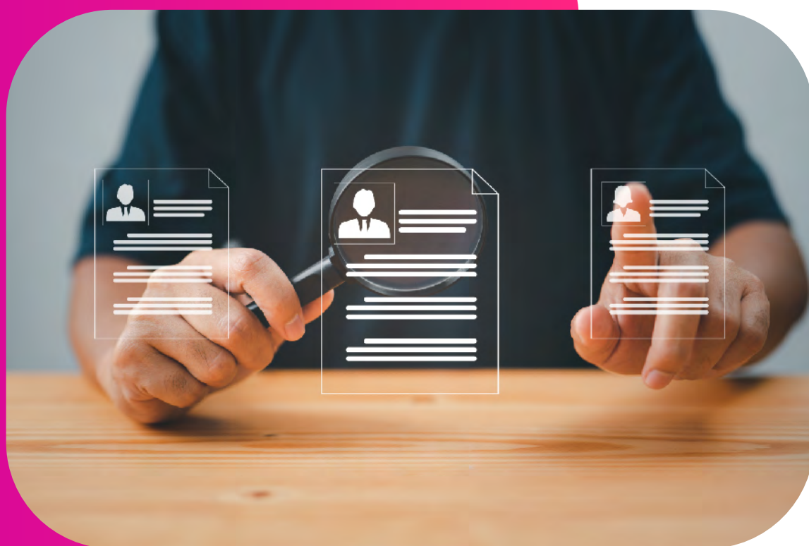
PHOTO GUIDELINES HOSPITALITY SUPERSTAR RESUME